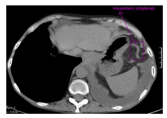
fig 5 showing mesenteric collaterals