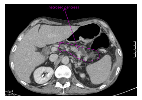
fig 3 acute pancreatitis with necrosion