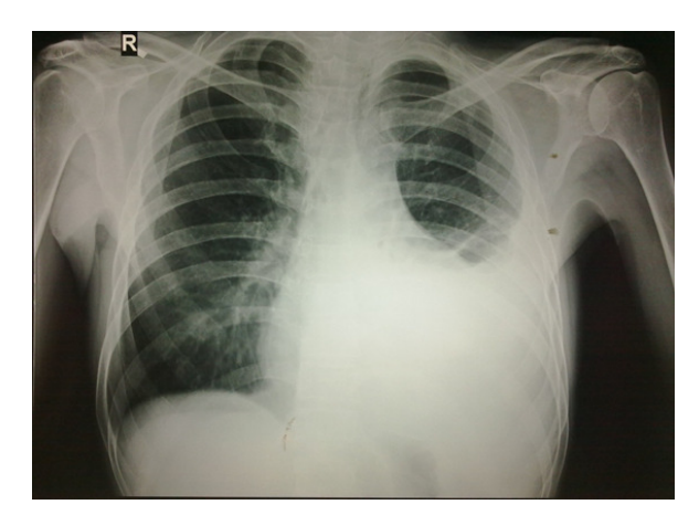
fig 1 X ray chest showing Left pleural effusion and sub segmental collapse of left lower lobe

Pancreatitis should be taken into consideration when hemorrhagic pleural effusion occurs, especially when it occurs concomitant with elevated amylase level of pleural fluid. In such a condition visual methods such as CT scan, ultrasonography and ERCP are so helpful. Treatment with drainage by a chest tube, with concomitant conservative treatment of the pancreatitis, is usually effective in massive pancreatic pleural effusions and Gastrocystotomy for pancreatic pseudocyst.