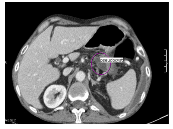
fig 4 showing Pseudocyst near body of pancreas